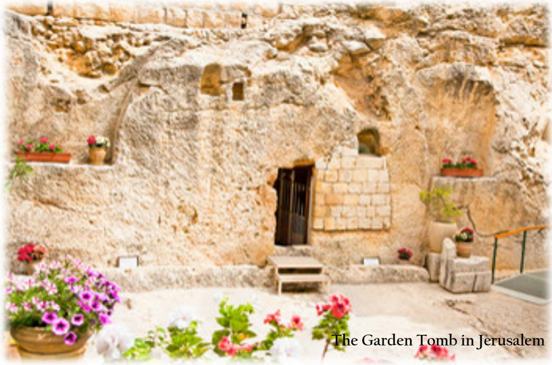
The Garden Tomb in Jerusalem

“He is not here, for He has risen, just as He said. Come and see the place where He lay.”