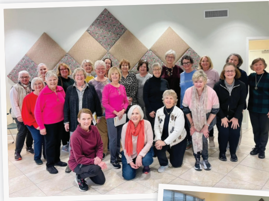
Women's Epiphany Retreat