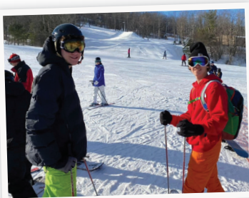
Student Ski Trip December 2022