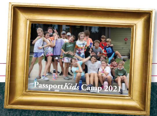
Passport Kids Camp 2021