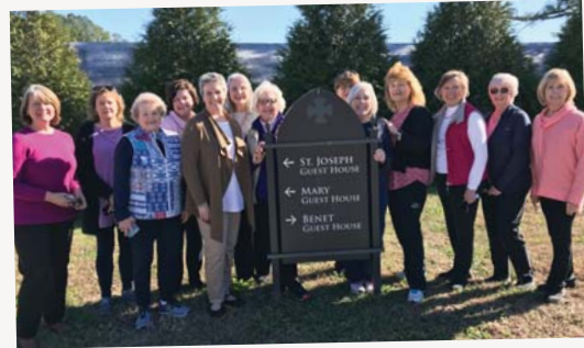
Women's Retreat-Benedictine Sisters Retreat Center

ALL THAT JAZZ - FAT TUESDAY PANCAKE DINNER TUESDAY, FEBRUARY 25TH 6:00 P.M.