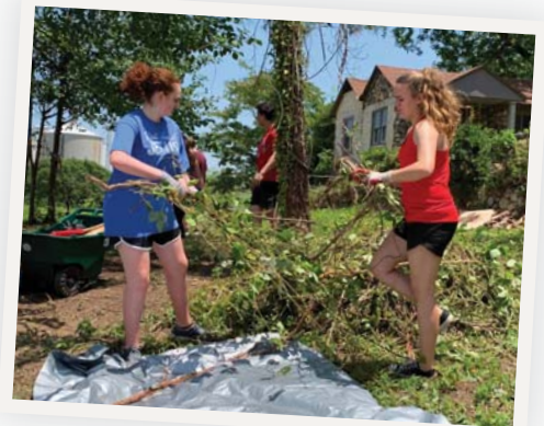
Youth In-Town Mission Project