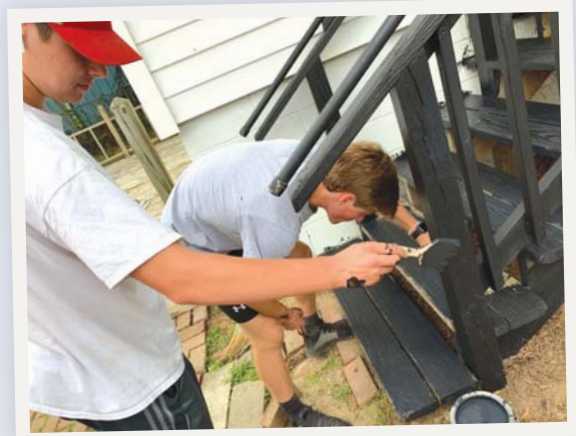
Youth In-Town Mission Project

Youth - Diving Into The Word, Keith's Home 5:00-8:00 pm