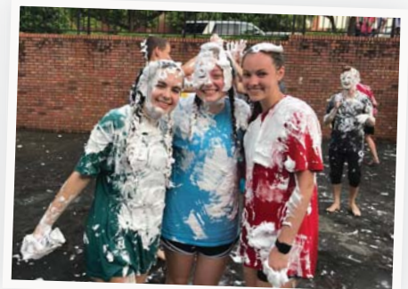
Youth Messy Game Night Fun!