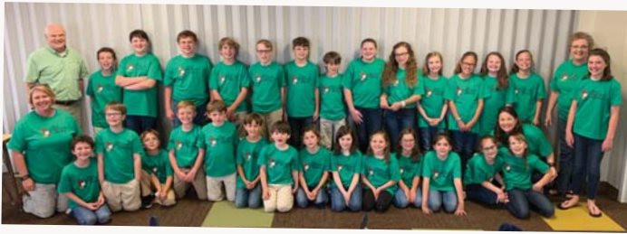
THANKS, CHILDREN'S CHOIRS!